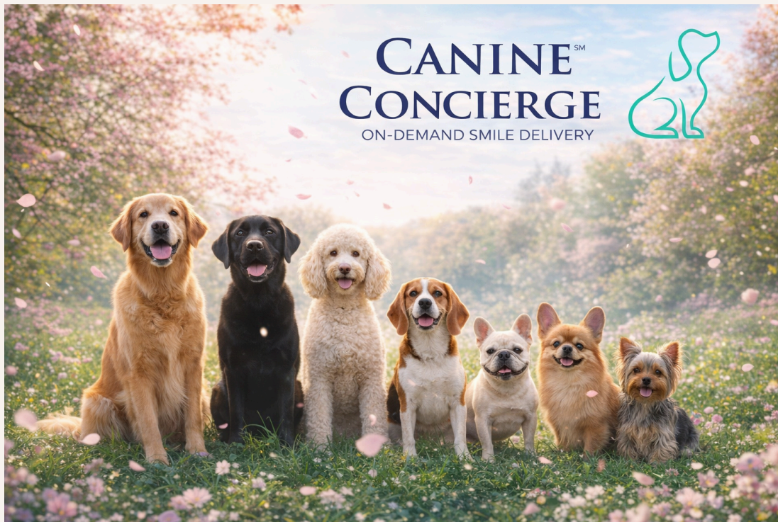
Explore how different organizations evaluate therapy dogs