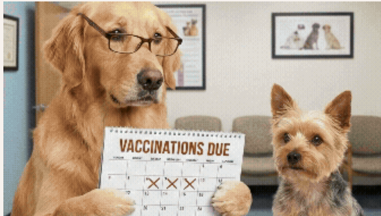
Therapy dog evaluations vary widely by organization, setting, and visit expectations

Each organization evaluates temperament, handler teamwork, and real-world readiness differently.